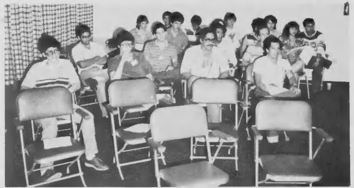
and summer employment), participated in Lago's summer programs this year.